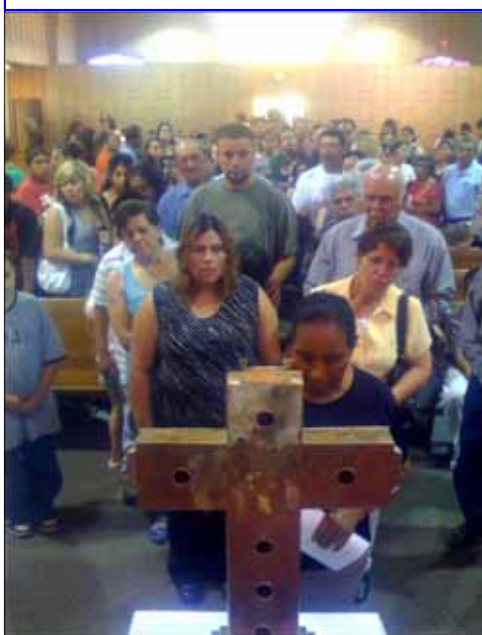
Parishioners of St. Joseph's Church, Sunnyside, line up to pray and touch the relics of the five martyred Mexican priests