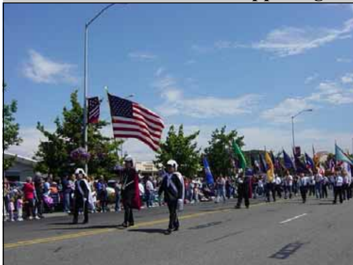
Council 3361, Oak Harbor - 4th of July Parade 2006 - Fifty state flags. Assembly 2276, Whidbey-Fidalgo is the Color Corps.