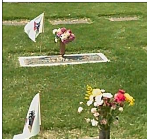
Richland #3307 —KC Flags placed on deceased members’ graves by Council every Memorial Day