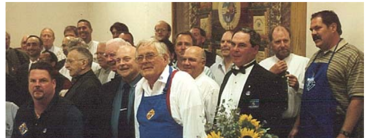
Tacoma 809 members at 100th Anniversary Celebration

Form #100 Belongs in All of These Places